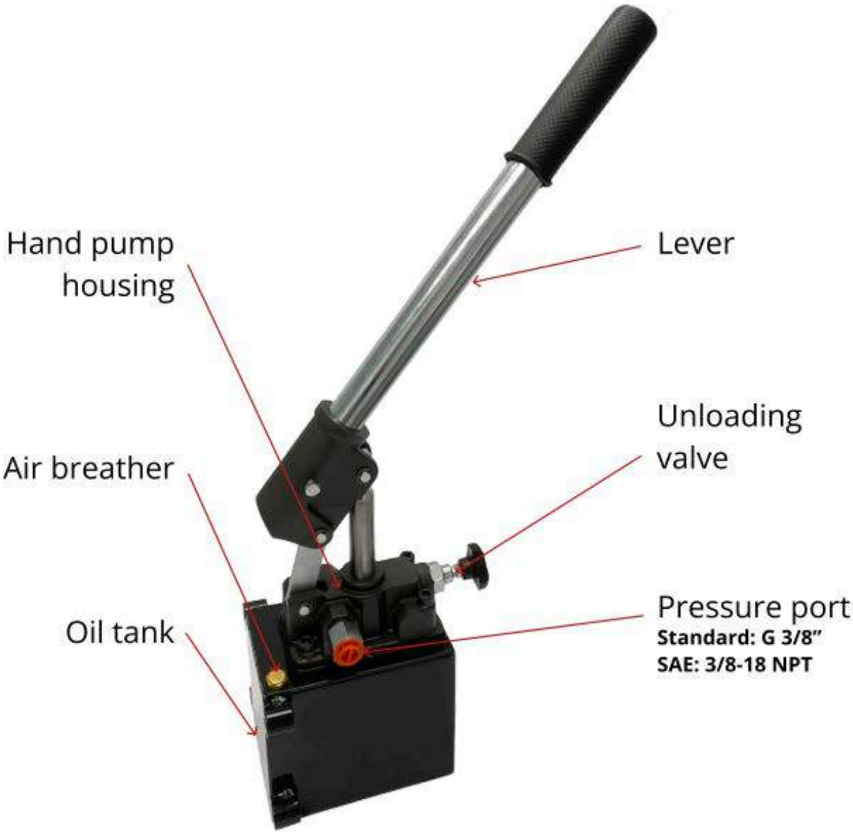
Photo 1. Main components of a single acting hand pump

TO PROTECT YOUR WARRANTY, USE ONLY MAGISTER HYDRAULIC OIL.